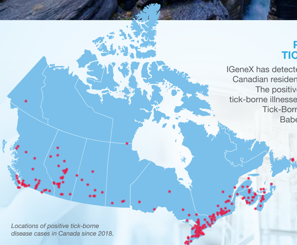
Locations of positive tick-borne disease cases in Canada since 2018.

Tick-Borne diseases are continuing to spread throughout North America and into Canada. IGeneX Laboratory has seen an 85% increase in testing for TBDs in Canada over the past five years, with positive cases detected in every province and in over 250 Canadian cities. Let IGeneX help you find the best diagnosis for your patients.